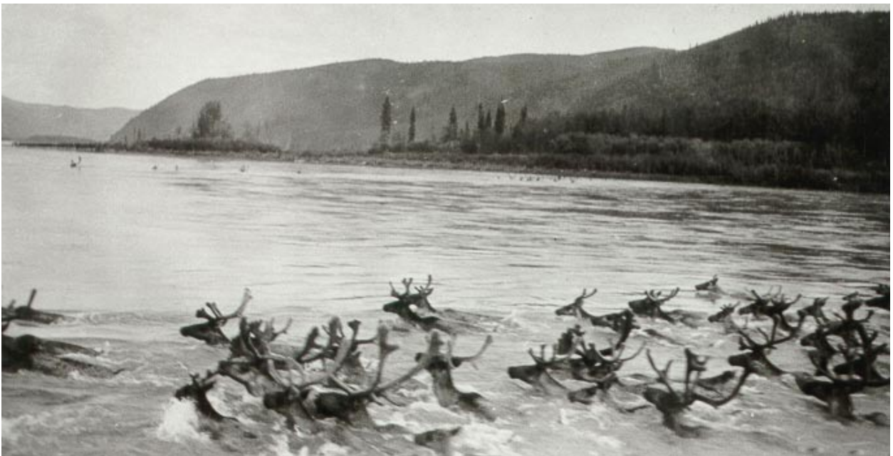
Caribou crossing Yukon River.