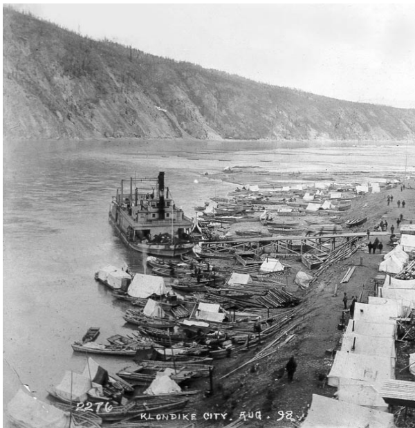
The Yukon River at low water flowing by Klondike City, 1898.

– Jody Cox, from: The Upper Yukon River, The Salmon and the People: A History of the Salmon Fisheries , 2000.