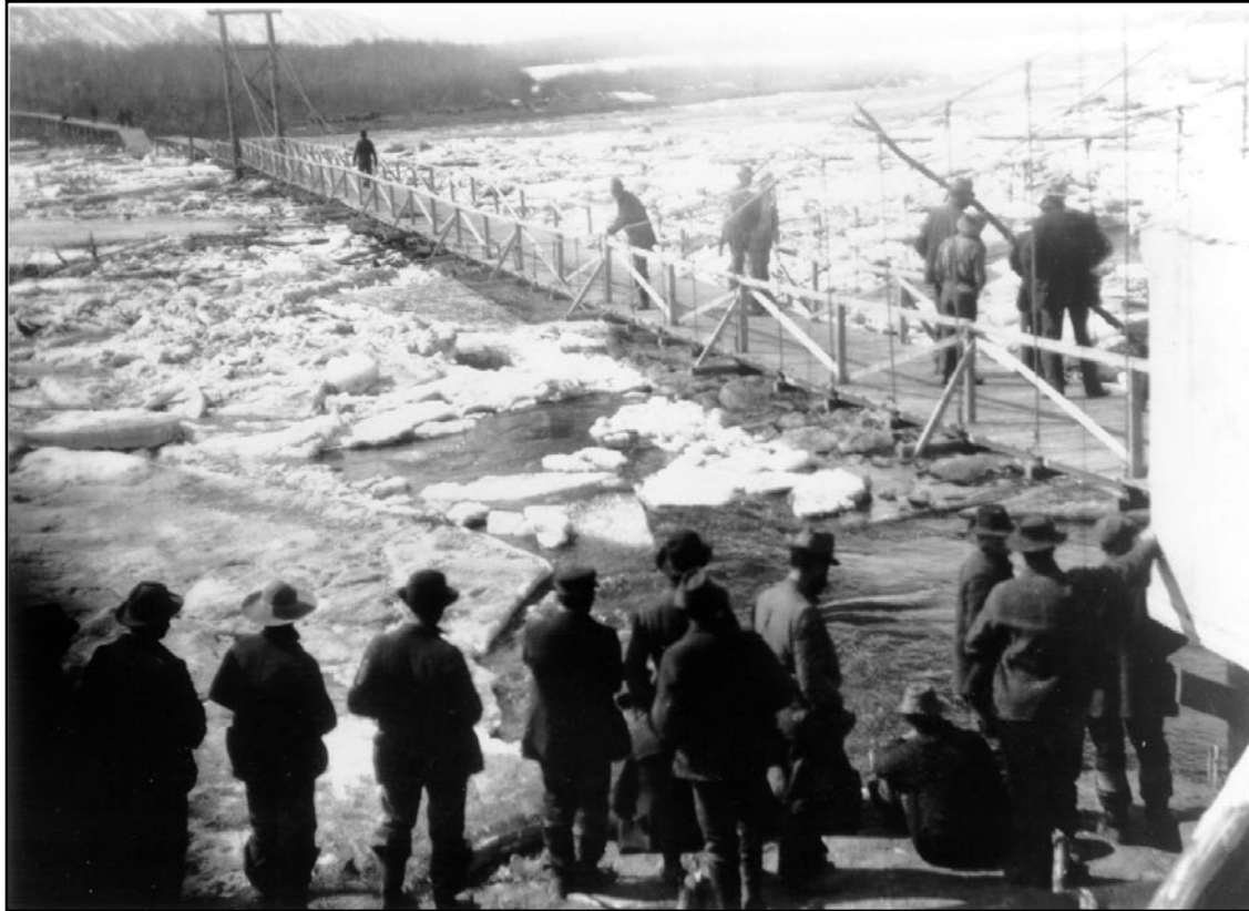
Watching ice take out the Klondike R. bridge during spring break-up, 1898.