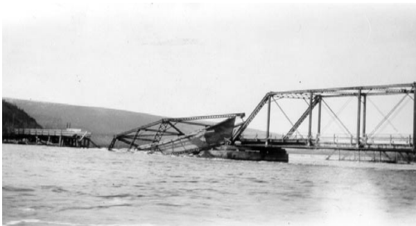
Collapse of the Klondike River Bridge during Spring break-up. PC/Townsend Coll. #236, 31/016