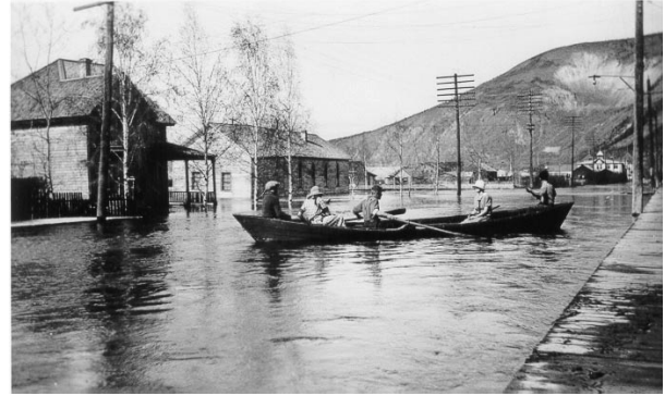
Boat in the floodwaters on a Dawson street.

Along the banks of the Yukon River, is the riparian zone , the place where land and water meet. A plentiful water supply ensures that plant growth is more rapid and denser than further inland. Dying plants – including sweepers, or fallen trees that have been undercut by the current – may shelter juvenile fish or the entrance to an otter’s den. Decaying vegetation supplies food to insects. These are