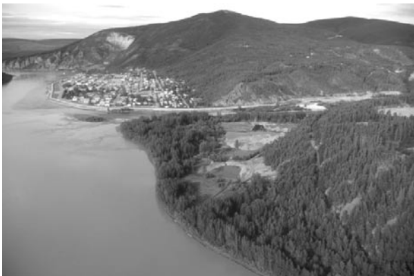
Confluence of Yukon and Klondike Rivers.